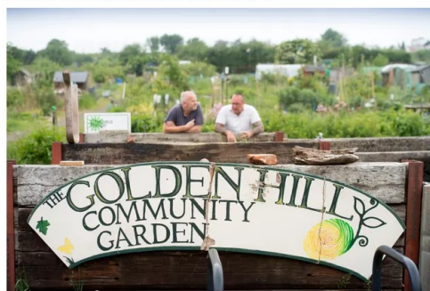
▲ Gardeners chatting at the Golden Hill Community Garden in Bristol UK. Community gardens, where volunteers gather to garden a private or public piece of land together, are becoming increasingly common in the UK. With this in mind, we would like to hear from those involved in these projects. Have you started a community garden recently? Why did you decide to join the effort? Tell us all about it below.

As community gardens become increasingly popular, we would like to hear from those involved in these projects