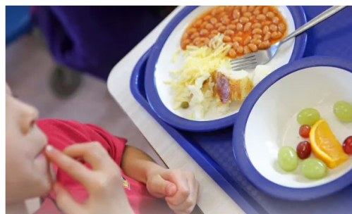
▲ Data from 9,000 children in 50 primary and secondary schools was analysed. Children who eat five or more portions of fruit and vegetables a day have the

Study prompts experts to call for nutrition to be included in public health strategies